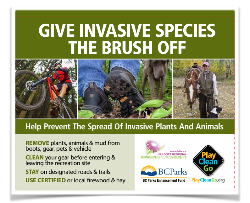
Photo: Example of bootbrush signs for installation at trail heads to the South Chilcotin Mountains Park.

LRISS was able to reach over 70,000 with the outreach and education program. Table 5 gives an overview of our activities in four different categories. Appendix 2 shows our activities in more detail.