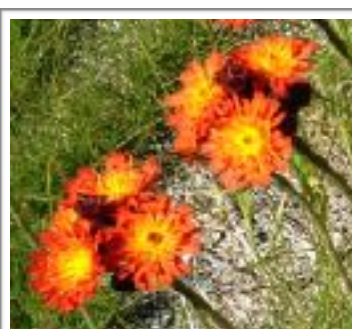
Spotted Knapweed, Blueweed & Orange Hawkweed.