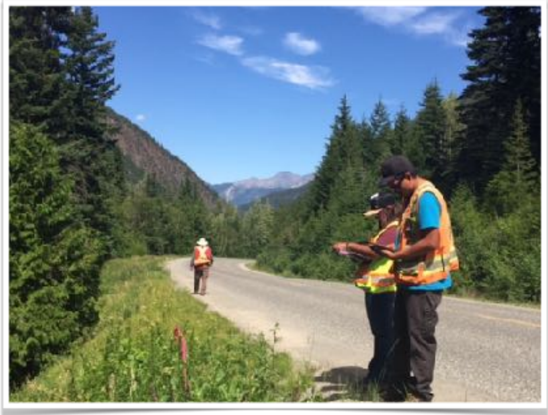
Photo: Highway 99 data collection by Splitrock Environmental, supervised by LRISS.