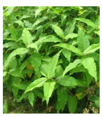
Himalayan knotweed