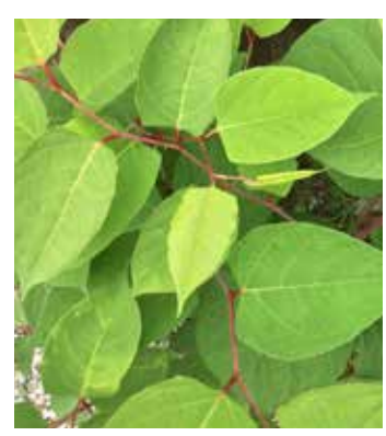
Bohemian knotweed