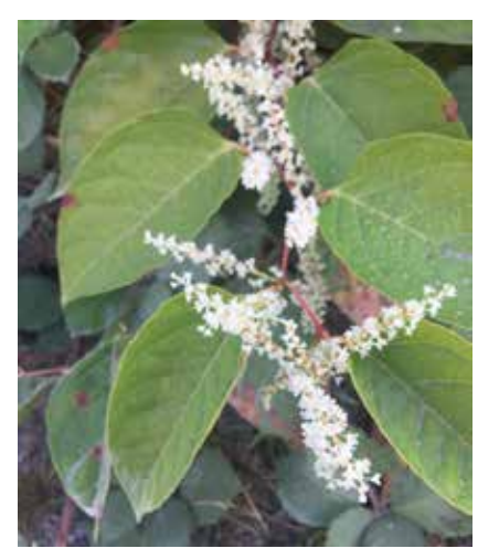
BOHEMIAN KNOTWEED FLOWERS