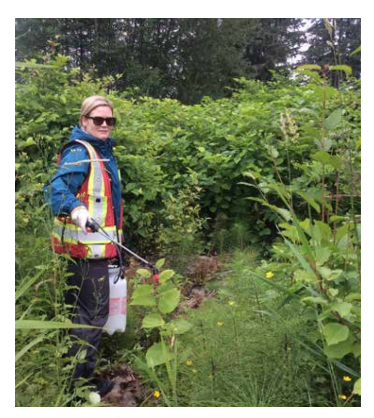
Spray-on herbicide application

For more information on how to obtain a licence and the requirements when working under the provincial <u>Integrated Pest Management Act and Regulation</u>, please review the Noxious Weed & Vegetation Management section on this webpage: gov.bc.ca/PestManagement.