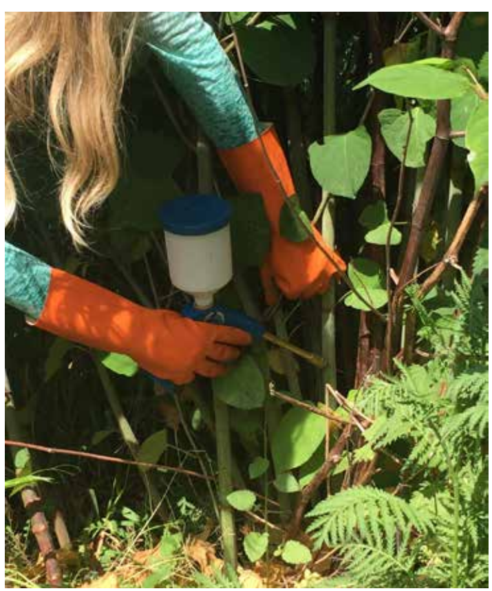
Stem injection