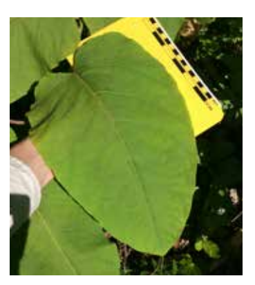
Giant knotweed