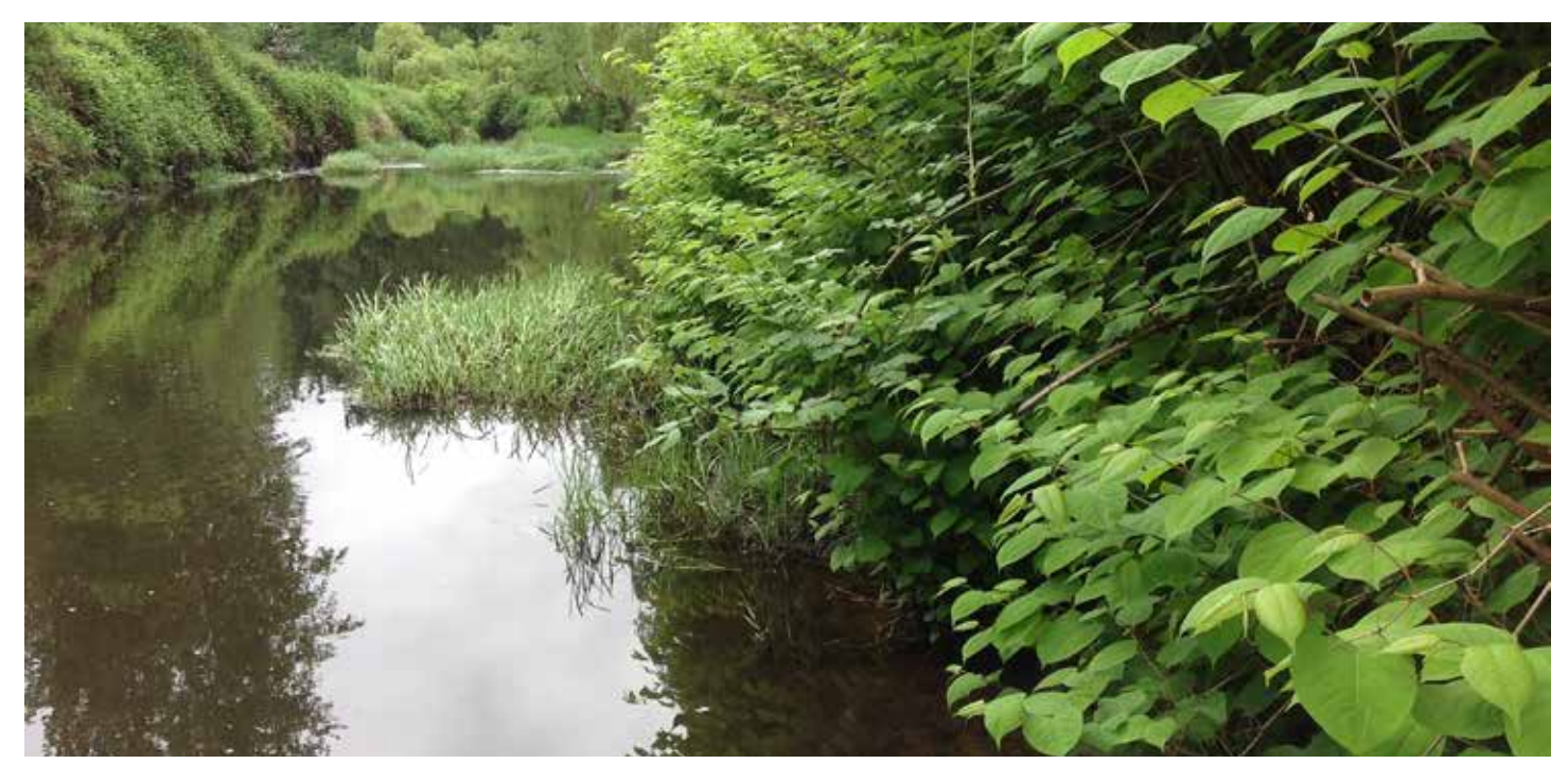
Knotweeds in a riparian area