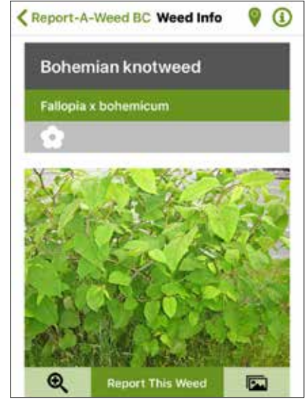
Snapshot of the Report-A-Weed app

Reports submitted through these channels are reviewed by invasive species specialists who coordinate follow-up activities when necessary with the appropriate local authorities. However, some people may be hesitant to report knotweed infestations as their presence may affect property values.