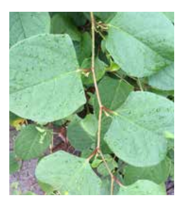
Japanese knotweed