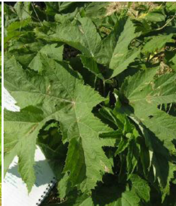
Cow parsnip leaf