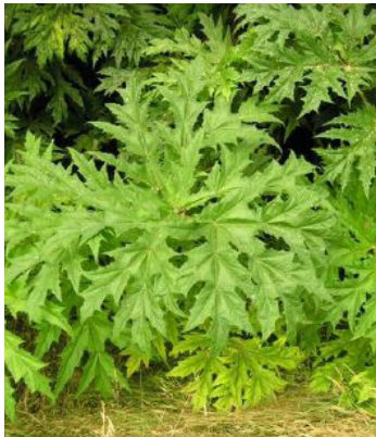
Giant hogweed leaf

Leaves of the mature plant and ripe seeds are reliable features to distinguish giant hogweed from cow parsnip.