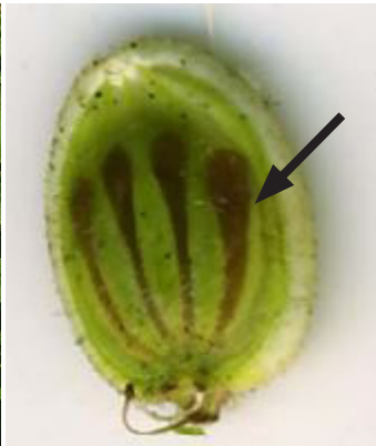
Giant hogweed seed: note length of oil tubes