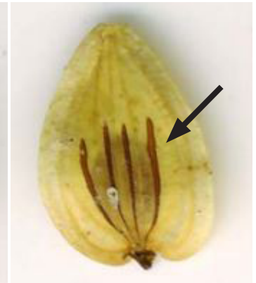
Cow parsnip seed: note length of oil tube (1/2 to 3/4 of seed length) and shape (narrow)