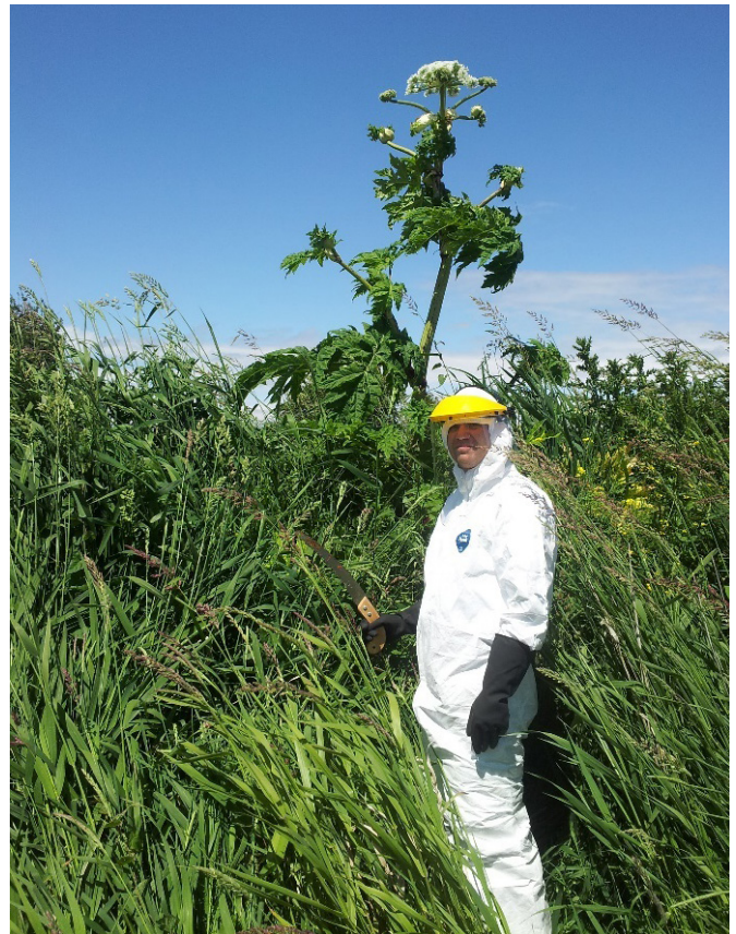
Personal Protective Equipment